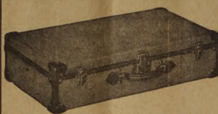
Superb New Line of Suit Cases

Have a few choice Bargains left in this line. Prices are as low as they ever will be.