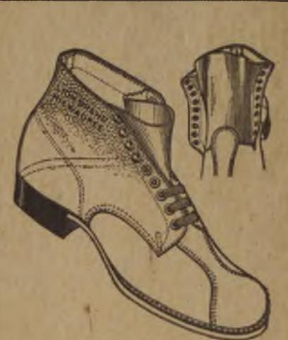
New Outing Shoes

Just a few left and we're going to close them out. We never carry over heavy clothing.