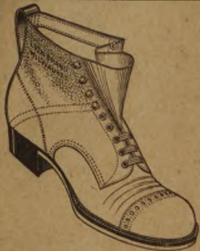
New Work Shoes

SUITS PANTS SOCKS SLIP-ON COATS WORK SHIRTS STORM RUBBERS AND DON'T FAIL TO SEE MY NEW SAMPLE BOOK OF MADE-TO-MEASURE CLOTHING AUTO COATS, see window WORK PANTS FANCY VESTS RAIN COATS OVERALLS SUIT CASES SHIRTS SHOES TRUNKS HATS OXFORDS COLLARS GLOVES SUSPENSERS NECK TIES