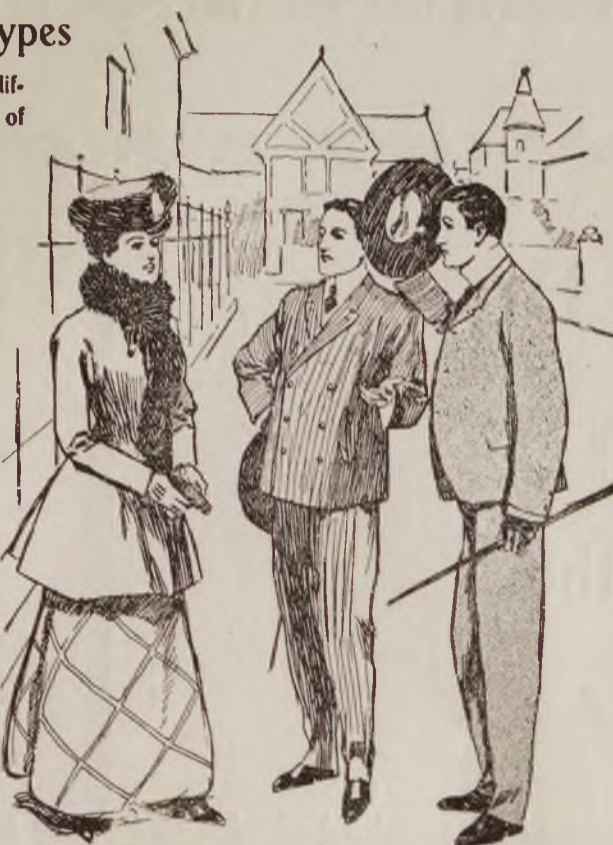
Copyright, 1903, Crouse & Brantlee, Utica, New York

You know how it is with yourself. Some look best in a double-breasted coat, and others show-off better in a single. One man may look real swell in a coat that fits him snugly in the back, and another fellow with the same coat would be guyed as a dude. It all depends upon the way you are built. Crouse & Brantlee, the well-known Manufacturing Tailors of Utica, New York, build their garments to suit just those little peculiarities. Therefore it is: "You may come around here in the blissful anticipation of not only getting a SUIT your SIZE, but a SIZE that will SUIT."