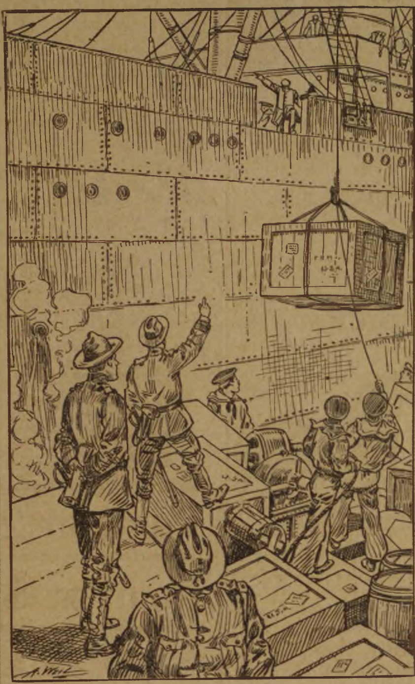
Great Cases of Machinery Swung Up from the Holds.

On board the gunboat were men accustomed to unquestioning obedience, and on the transport was a little army of skilled mechanics and engineers who had been called from their usual occupation by imperative orders and requested to tell none but their families that they might be absent for several months. There was not a man aboard any of the craft who had not taken a pledge of absolute secrecy.