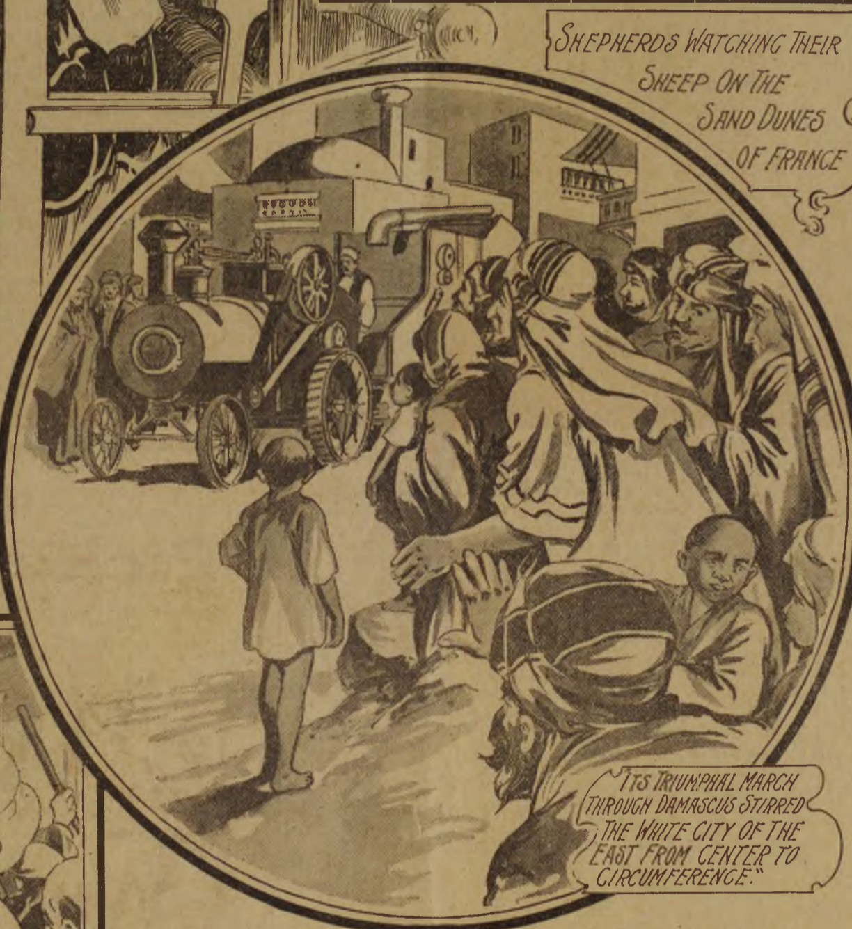
ITS TRIUMPHAL MARCH THROUGH DAMASCUS STIRRED THE WHITE CITY OF THE EAST FROM CENTER TO CIRCUMFERENCE.

Do You Feel Like This? Does your head ache or simply feel heavy and uncomfortable? Does your back ache? Does your side ache? Do you feel fagged out? The tonic laxative herb tea known as Lane's Family Medicine will clear your head, remove the pain in side or back and restore your strength. Nothing else is so good for the stomach and bowels. At druggists' and dealers', 25c.