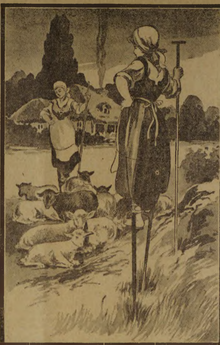
SHEPHERDS WATCHING THEIR SHEEP ON THE SAND DUNES OF FRANCE

At times the United States consuls have dangers to encounter. It was exceedingly unpleasant in Spain for some of Uncle Sam's representatives during the months just prior to the beginning of actual hostilities at Manila bay. In Chili and in Turkey within a comparatively short time the consuls have had occasion to put up a brave front against the populace and to show the stuff that they were made of. Fresh in the memory of everybody is the awful time which the beleaguered legations had within the walls of "the forbidden city" in China.