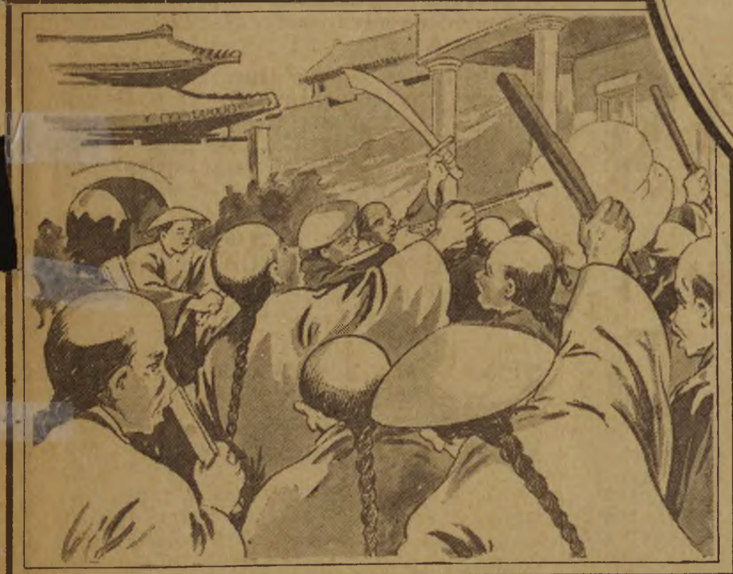
BOXERS ATTACKING AMERICAN LEGATION IN PERIN, CHINA

scrub oak, and thickets of white and purple gorse, fighting stubbornly for a hold upon the shifting sands, with here and there some straggling groups of pine, the protesting remains of a great forest which wind and sand, and fire, and water had spared." This was a description