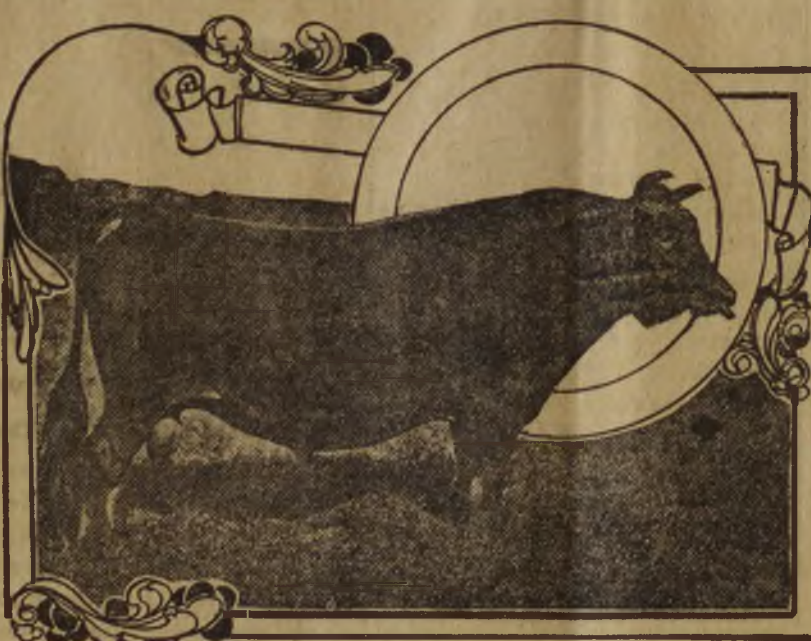
NOBLE OF OAKLANDS, SON OF LADY VIOLA.

The world's greatest cheese, weight six tons, will be on exhibition at the National Dairy show, Chicago, International amphitheater, Union stockyards, Oct. 26 to Nov. 4. It was made from milk produced by 861 herds, of which the illustration shows the one which was located nearest Appleton, Wis., where the big cheese was made.