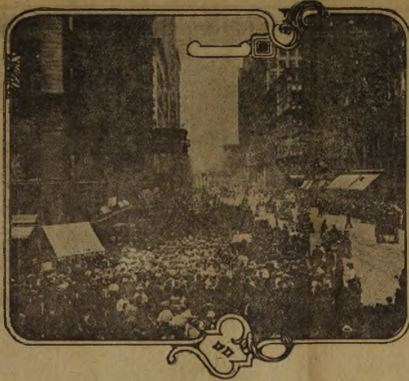
CHICAGO'S HOLIDAY WEEK.