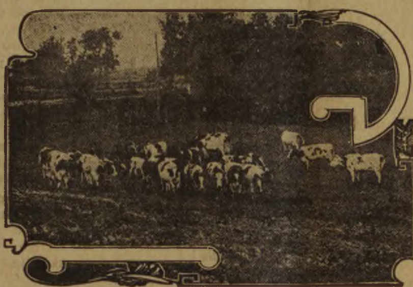
WHERE THE BIG CHEESE CAME FROM.

Chicago is to have a great "long distance" holiday from Oct. 26 to Nov. 4, when the National Dairy show will be held at the International amphitheater, Union stockyards, Chicago. President Taft will be at the show Oct. 30, and there are special attractions arranged for every day. There will probably be dairy farms given away. The railroads have been requested to make reduced rates, and those in the Central Passenger association have already announced a rate of a fare and a half on the certificate plan. The fall is the best time of the year to visit Chicago.