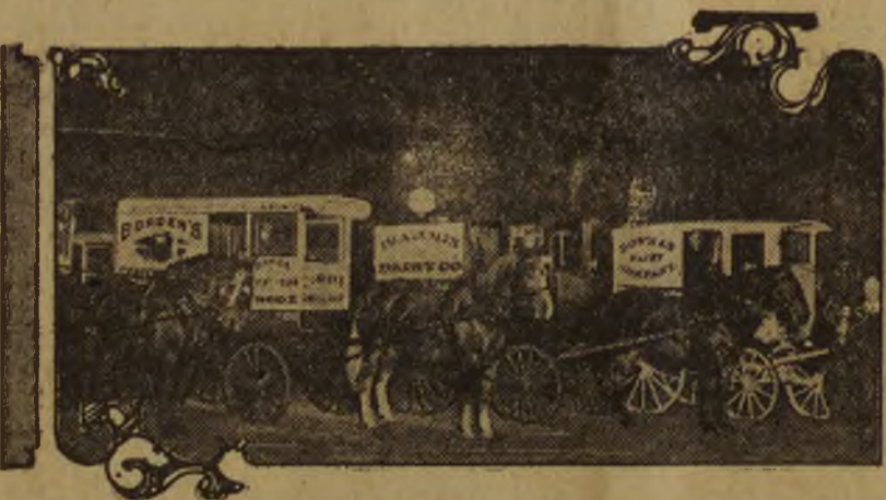
CITY MILK DELIVERY DISPLAY.