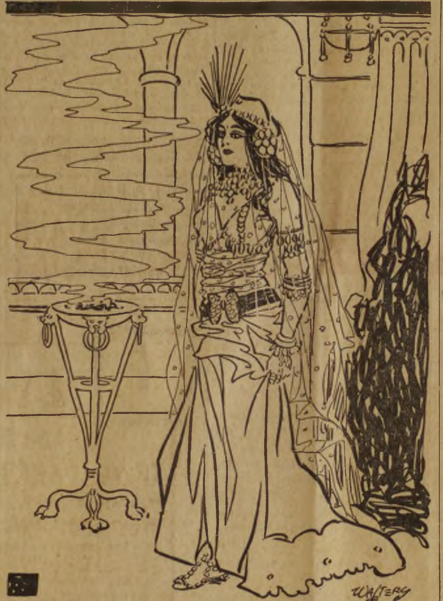
The Scarlet Lips Curled and the Eyes Grew Cold and Hard.

"Nay, but there is a mistake," He recovered the power of speech tardily, and would have put her from him; but she held tight to him. "I am not thy husband, nor yet a Rajput. I come from America, the far land where thy