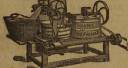
The Roanoke Power Washer and Wringer

No Lifting, Rubbing or Twisting. No Headache, Backache or Tired Feet.