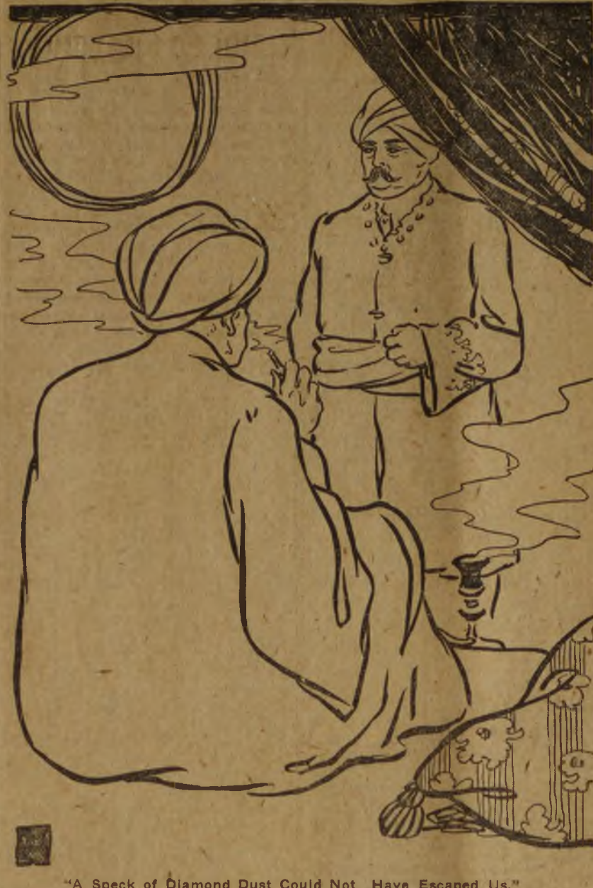
"A Speck of Diamond Dust Could Not Have Escaped Us."

to gather his strength, set his shoul- eager to begin working without delay. scutable features of him whom for so der against the wall and threw all his There was a fire escape on the floor many years he had called "master." force into a single, vigorous push, whence he looked out—a thoroughly "Is it possible?" he exclaimed at The movement almost threw him to modern contrivance with flat steps, last. "And I gave my personal atten-