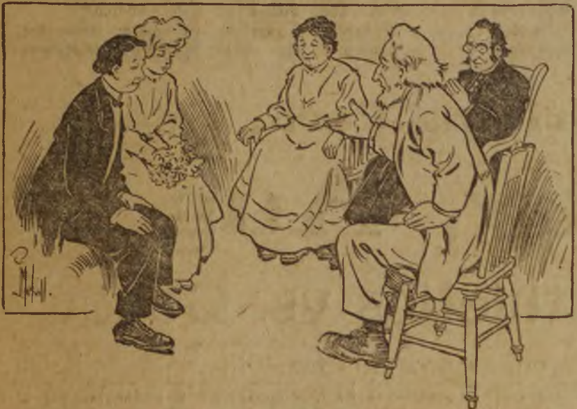
Marriage is the Time When a Mote Gets into the Eye of All Experience.

graciously been presented to her. And the sweetest of all territories is the enjoyment of the spare time of her husband. She finds her mellowest pleasure in his society, and can't very well understand why she doesn't supply his every want. He has told her time and again that she did. But there comes a time when he wants to stay out a night, to sniff the air of his former reckless freedom. It's his nature. It was her nature as an obedient daughter to stay at home of nights. And when she finds that she hasn't been strong enough to remodel his nature she grieves in her soul. "Many a night I've sat up waitin' for you," said Mrs. Jucklin. "Yes, but I came, didn't I?" "Yes," she admitted, "but at what time?" "Oh, I didn't have to keep track of the time. But I want to say to Billie that stayin' out at night is one of the worst habits a man can fall into. It