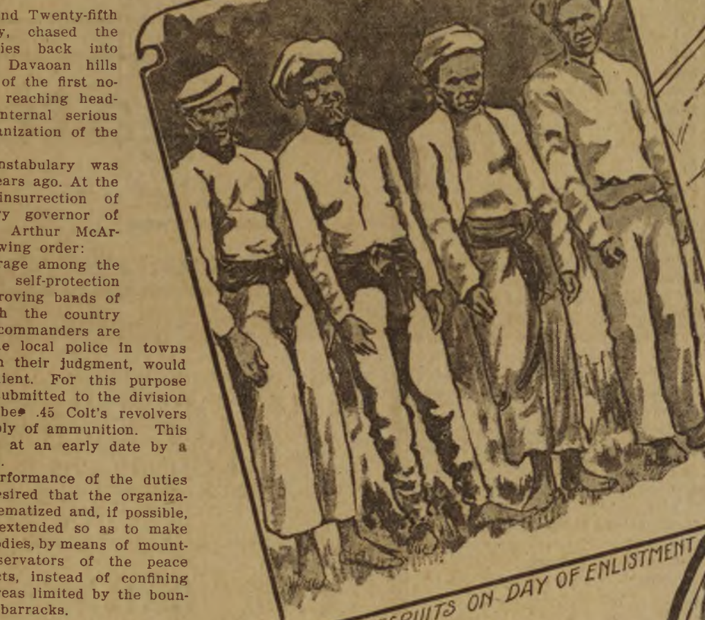
SAME RECRUITS ON DAY OF ENLISTMENT

as the veriest of rookies. In the second picture, straight, trim, clean, well-drilled and set up fit to make even a regular look to his laurels, they are presented again. In a third of a year they have been converted from semi-savagery and are representative members of one of the best disciplined bodies of troops in the world.