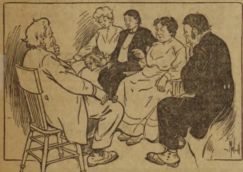
"Many a Time I've Sat Up Waitin' for You," Said Mrs. Jucklin.

is the dark side of married life. No matter how truthful a man may have started out, it makes him more or less a liar. Midnight and the truth ain't twins. And a man hasn't reformed when he curses himself for bein' a fool. The wisest man feels he is a fool when he stays out too late. There ain't no reproach more fetchin' than to see the moon fadin' away in the heavens. Of course, a man can't stay at home all the time. The fact is, I'll be hanged if I know what he is to do. I'm not talkin' about the saint, but the flesh-and-blood man. You may try all you please to make a hymn of life, but the first thing you know a jig tune pops up. So, Billie, when you catch yourself inclined to whistle too many of the jigs, stop and ask yourself if they pay in the long run. I don't mean that you should be serious. Nothin' is gained by bein' solemn. David is remembered as well for havin' danced before the ark as for some of his psalms wherein he wanted the Lord to wipe out a whole lot of folks. Have all the fun you can, but recollect it ain't the healthiest fun if you have to lie about it to your wife. The old idea that a man is excusable for lyin' to his wife ain't a good one. When