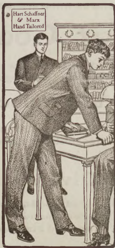
Copyright 1903 by Hart Schaffner & Marx

Young Men's Suits at $7.00, $8.00, $10.00, $12.00 up to $18 if you want them. We're not only up-to-date but we're a date ahead. Try the Big Boston for Reliable Clothing. You can't go wrong.