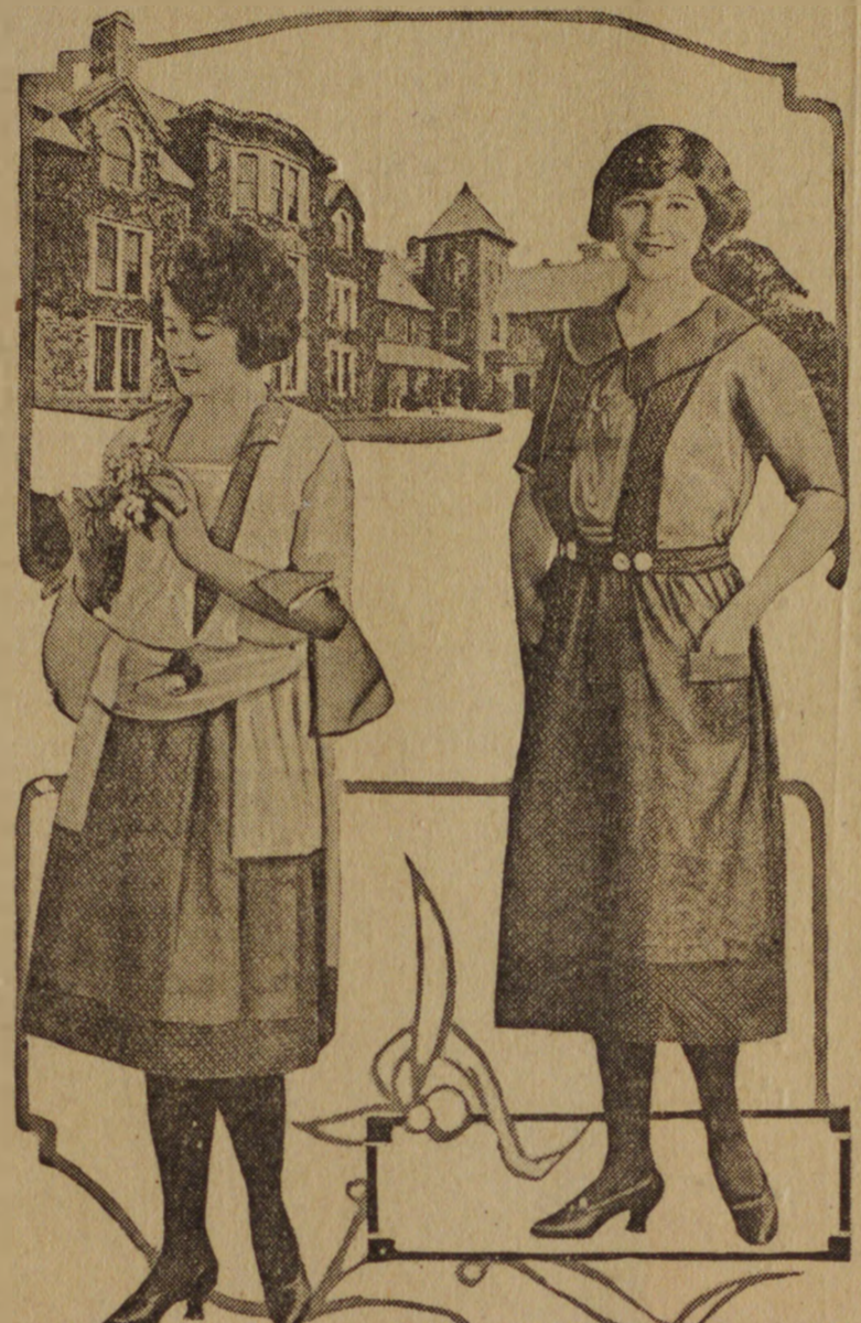
Utility Dresses for Late Summer.

THE streets of the cities bear evidence that women have decided to wear clothes that look comfortable and are comfortable in the hottest days of summer.