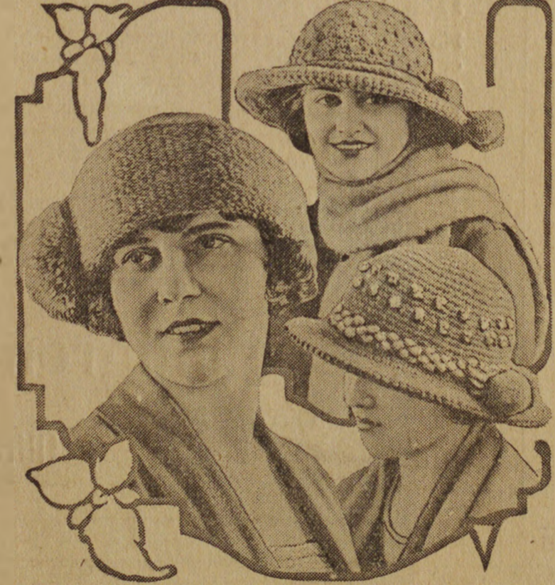
Crocheted Hats Now the Thing.

and chiffons and the sheer cottons, make a kaleidoscope of color in the shopping districts and tea rooms.